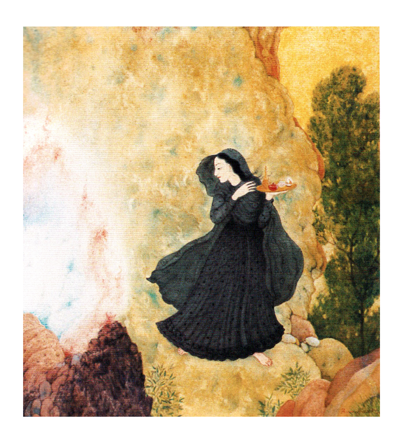
Easter Sunday April 17, 2022 8:00 a.m.